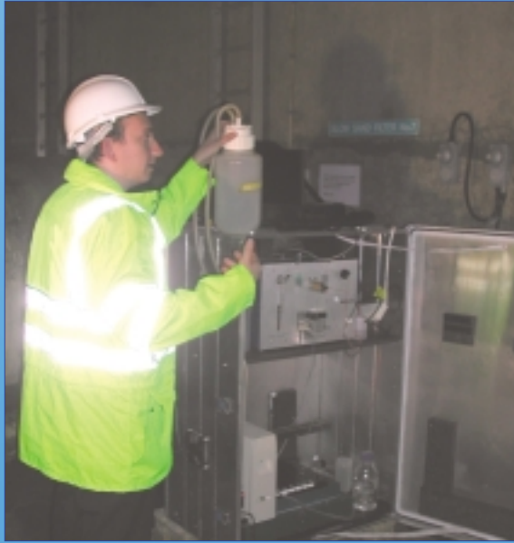
The CALM in field demonstration at a Thames water treatment plant.