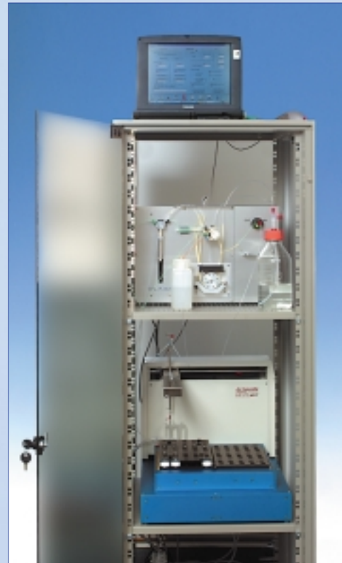
Colifast® At-Line Monitor (CALM) Fully automated