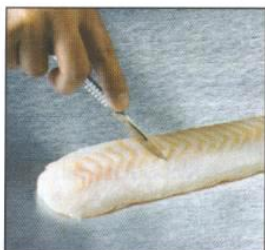
1. Take a 1cm 3 sample.

the spoilage reaction. Since a 72 hour incubation period is required to maximize the count, and laboratory facilities and trained personal are needed, the method may be considered as time consuming and cumbersome. In 2003, Colifast AS together with the Norwegian Institute for Fisheries and Aquaculture Research developed a rapid test for estimation of the content of SPB in fish. The quantification is based on the formation rate of FeS which is measured as reduced background fluorescence in a liquid medium. This test, FAST, has been further developed and simplified, and require minimum of skills and laboratory facilities. Beside a vial containing the FAST medium, a sterile scalpel and an incubator is required to perform the analysis. The illustration below shows how the FAST test is performed. The measurement principle is based upon formation rate of FeS resulting from the growth of SPB in the liquefied FAST medium. During growth of SPB, ferric iron is converted to ferrous iron, and inorganic and organic sulphur compounds to sulphide, which precipitates as black FeS. The precipitation, which colours