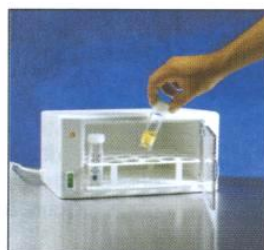
3. Incubate sample at 30°C.