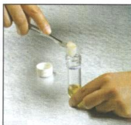
2. Place sample in FAST vial.